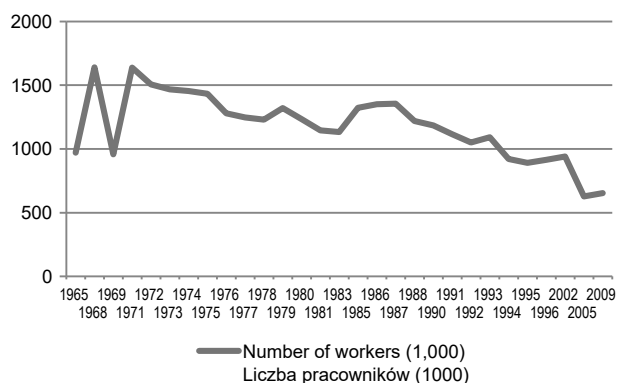
Fig. 1. Employment in South African agricultural sector

Rys. 1. Zatrudnienie w sektorze rolnym w Afryce Południowej